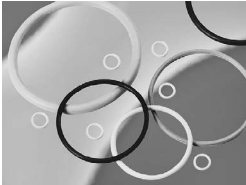
Groove Dimensions for Round Cross-Section O-SEALS